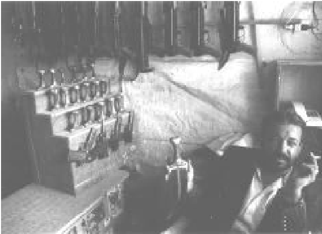
A jambiya trader in Amran, north of Sanaa, holds up his own dagger, which he offered to us at USD 12,000.

which laments the loss of the rhino horn trade, blaming wildlife conservationists. Handles made from water buffalo horn, the only alternative substance this family claims it now uses, they say is far less profitable. Imported from India, one cut piece of water buffalo horn the size of a cigarette pack and weighing 150 to 250 g costs USD 0.25 to 0.50, and once made into a handle it is priced at only a dollar. Plastic pieces for handles imported from Taiwan, which a few craftsmen use, cost only USD 0.15 each before being crafted into a handle, so these too provide little profit. Rhino horn handles, apart from being valuable in themselves, were also used to provide extra profits as the waste was sold. The traders still are waiting for permission to sell their remaining large stocks of rhino horn chips and shavings, left over from the handle-making process, that they registered with the government in 1993. We learned, however, that an Indian businessman living in Hong Kong who also has enterprises in Oman and Dubai comes several times a year to Yemen to buy the highest quality chips from the main jambiya family in Sanaa for USD 600/kg. Powder is worth less than chips, because powder gets mixed with dirt during filing; the Indian trader buys it for USD 400/kg (table 2).