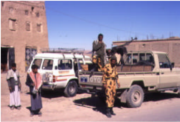
Because of the current risk of kidnappings in the far north of Yemen, an army escort accompanied us on the long journey from Sanaa to Sadah and back.