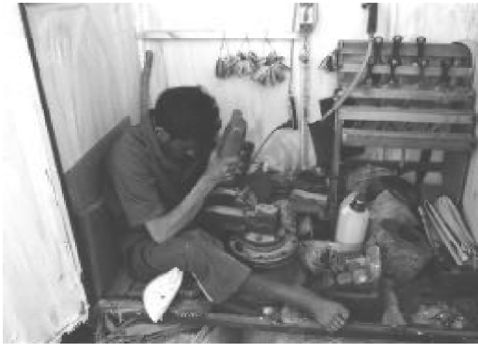
A Sadah jambiya craftsman drills holes into a water buffalo horn handle, which has the curved top that is typical of the Sadah style.