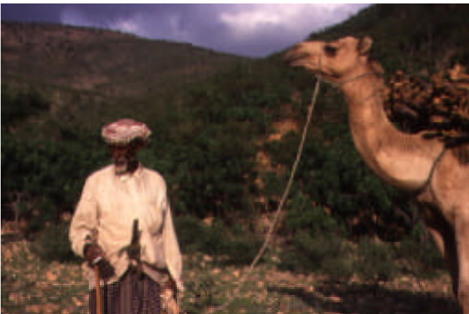
Straight knives with handles made of goat horn are worn on the island of Socotra.