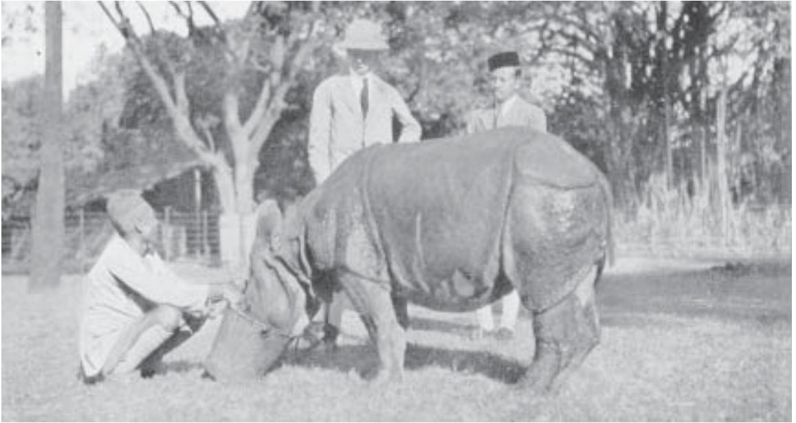
Figure 2. A rhinoceros from Nepal kept at the Victoria Gardens in Mumbai, India, in January 1922 en route to London Zoo.