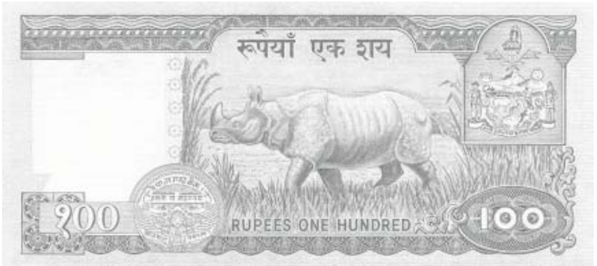
Nepalese 100-rupee banknote, in use since 1961, showing a Chitwan Valley rhino.

this account, it will be seen that the rhinoceros is armed with much more formidable tusks than the boar. These are the weapons he brings into such deadly operation, and not the horn, as many persons are led to believe.’ (Smith 1852:87–91)