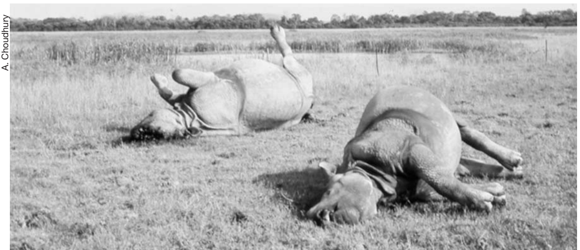
Rhino poaching, although declining, still takes its toll.