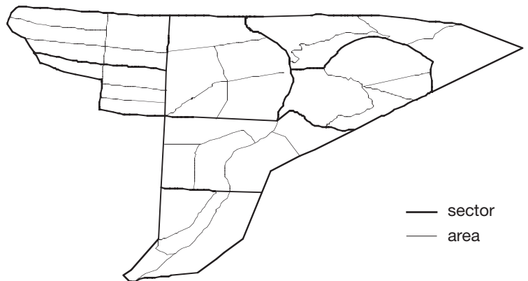
Figure 1. Solio Game Reserve showing partitioning into sectors and areas.

The 68-km 2 reserve was mapped using a Garmin 12 hand-held GPS set with freely available TrackMaker software enabling the transfer of data to computer. Features included the reserve fence, all main roads and usable side roads, bridges, rivers, dry riverbeds, water points such as dams and water troughs, and all entrance gates. The map was partitioned into smaller sections and areas (fig. 1) based on established roadways or natural features such as riverbeds. For security purposes, there were seven sectors with the objective of staffing each with a resident basic three-man patrol. For monitoring purposes, each sector was divided into four or five areas, and further by habitat type into bush or plain. All the data were loaded into ArcView GIS and used to draw sector maps and determine their size, the size of each area, and the proportion of bush and plain in each sector and area.