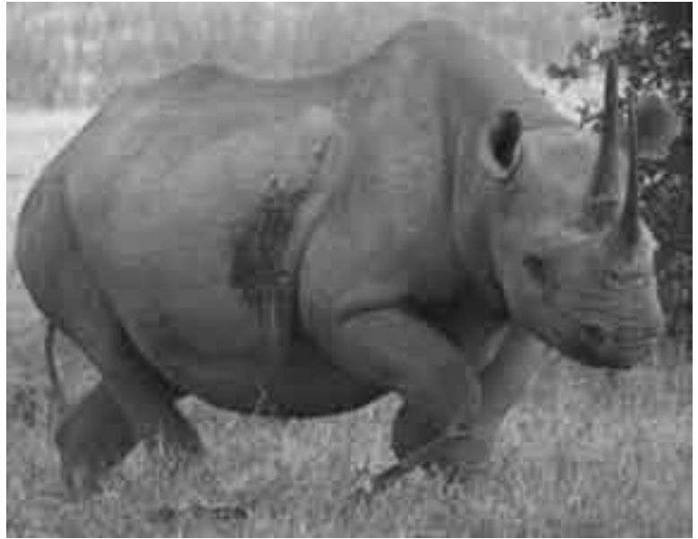
Figure 3. Pasuka, probably one of the oldest female rhinos in the world.

Rhino patrols are normally carried out at specific times, and sightings were most frequent either very early when rhinos were browsing or moving to a day bedsite or mid-morning where a rhino was on a day bedsite. Where a rhino was moving, the GPS reading taken depended on the precise time of the observation. Had it been 15 minutes earlier or later, the location could have been different by 1 km or more. Also to find a rhino, a patrol may have followed its footprints for several kilometres. For monitoring purposes, once a rhino has been found, it need not be seen again that day and there may be other duties for patrols such as detecting snares or other signs of poaching. This resulted in afternoon sightings being much less frequent than morning ones. It was found that rhinos often moved, especially around midday, from their initial morning location to a new location, which could be several kilometres away. There were instances where a rhino was sighted at night or in the early morning several kilometres from its normal