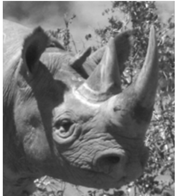
Figure 4. Karanja, probably one of the oldest male rhinos in the world.

daytime location. All these factors suggest that single precise GPS location fixes are heavily biased to time-related sightings and do not represent the full range the rhino uses. According to Tatman et al. (2000), the range should be estimated using additional data from