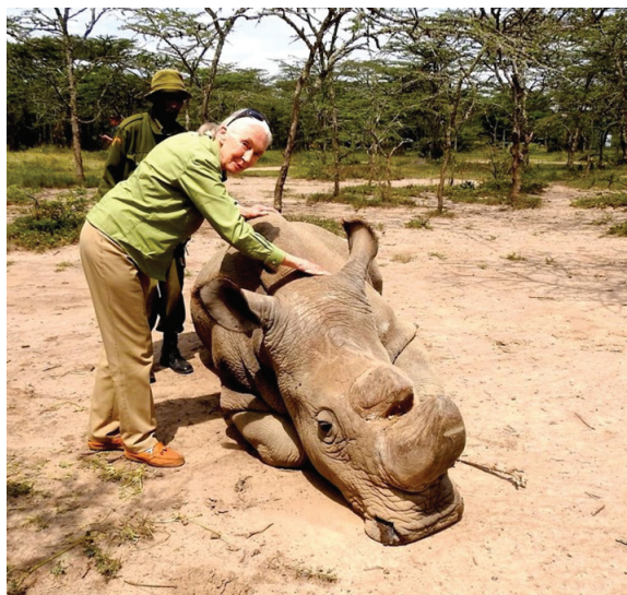
Fig. 2 Dame Valerie Jane Morris Goodall (3 April 1934–1 October 2025) at Ol Pejeta Conservancy with Sudan, the last male NWR, before he died

Chapter 4, in this sub-section on 'Species Accounts', presents a richly detailed and scientifically grounded account of the biology, behaviour, and conservation status of the black rhinoceros, ( Diceros bicornis ). Far beyond a guidebook summary, this chapter synthesises