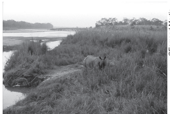
Rhinos in Nepal prefer the wet areas with long grass compared to the forests.

According to a census in 2000, there were an estimated 544 rhinos in and around Chitwan NP. The Park, an area of 932 km 2 , consists of floodplain grassland, riverine forest and sal forest in the Terai (a belt below the Himalayan foothills). From 2001 to 2005 at least 101 rhinos were poached in and around Chitwan NP (Martin 2006). Poaching continued at a high level in 2006 with a minimum of 19 rhinos killed out of a population of around 400. Of these, nine were poached within the Park, mostly near the northern boundary. The remaining 10 were poached north