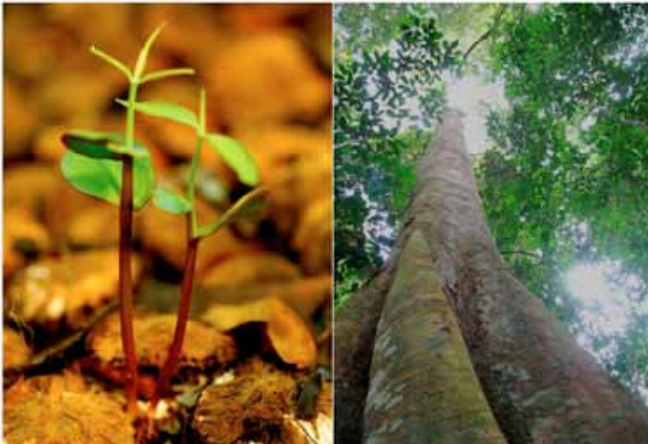
Figure 3. Seedling and adult tree of Irvingia gabonensis .