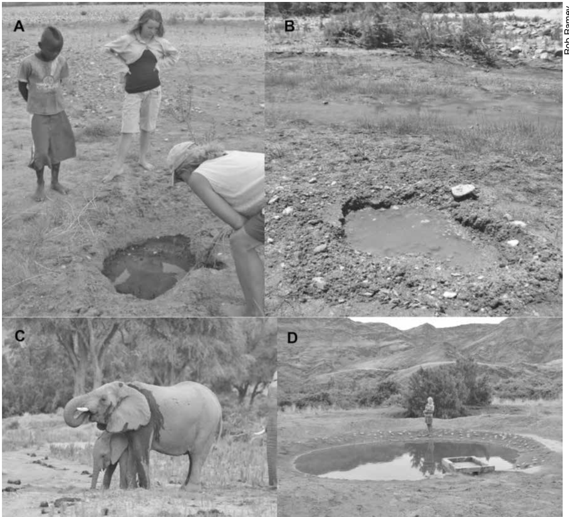
Figure 1. A. Shallow well dug by an elephant in a dry section of the Hoarusib River. B. An elephant well immediately adjacent to surface flowing water in the Hoarusib River. C. Elephants drinking from an elephant well in the dry bed of the Hoanib River. D. Artificial drinking pool at the East Presidential borehole, Hoanib River.

and trunks in the dry sand of the riverbeds where groundwater nears the surface. These 'elephant wells' are up to 1 m deep (Figure 1a–c), and are used not only by elephants but by numerous other species as well, for example, springbok, jackals, baboons. Curiously, elephants will go to great lengths to dig wells immediately adjacent to free-flowing surface water or pools, rather than drink from those readily available water sources (Figure 1b). This behaviour is not unique to desert-dwelling elephants and has