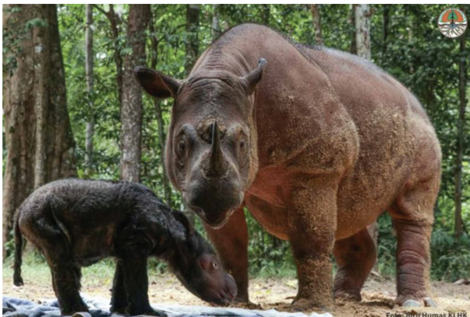
Above, center and below. Figure 1–3.