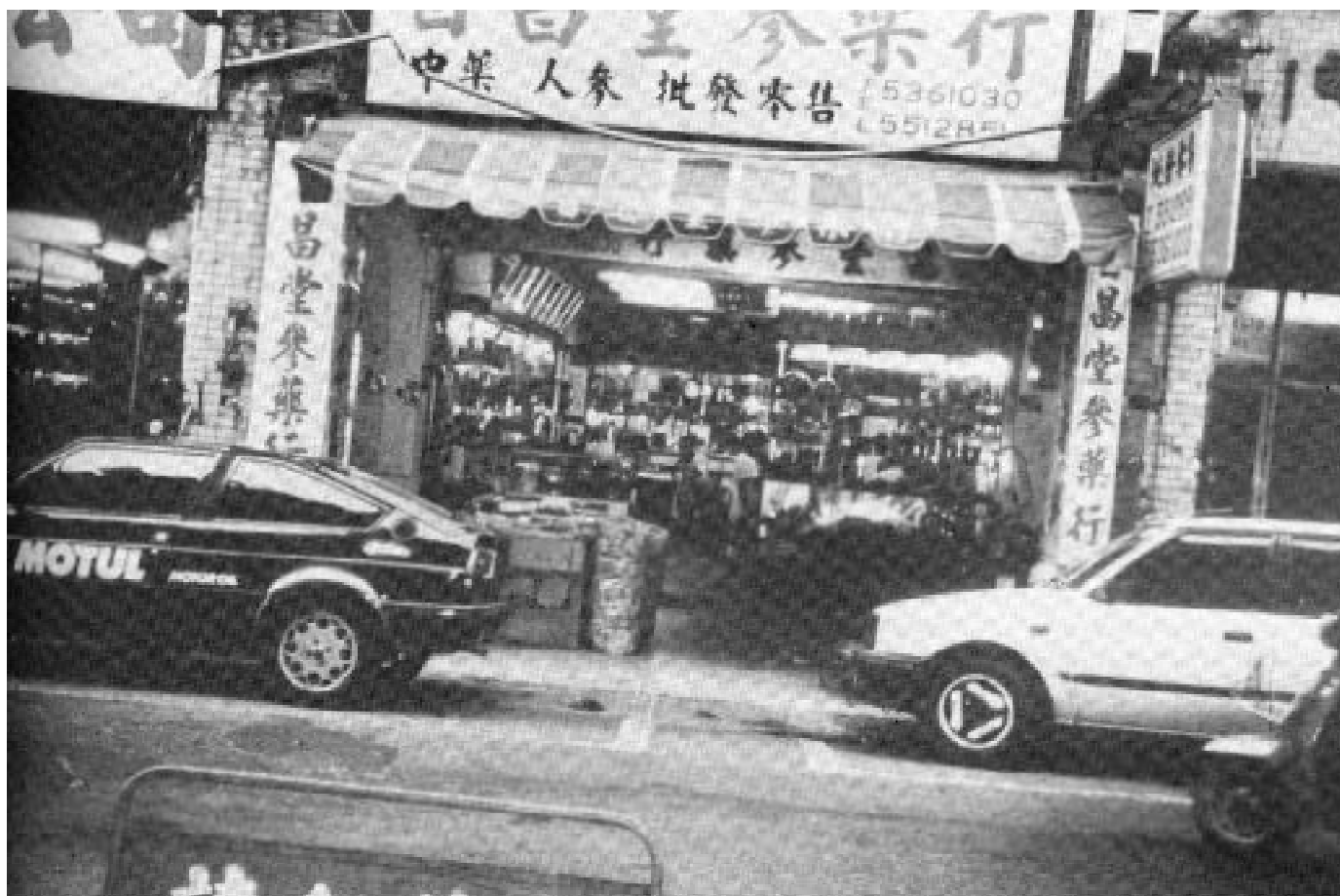
A typical medicine shop in Taiwan offering rhino horn for sale