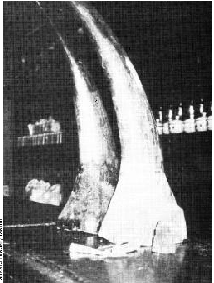
Esmond Bradley Martin

According to an article in the Botswana Daily News, 13 October 1988, and from confidential sources in southern Africa, in early 1988 Botswana Customs and Excise officials seized rhino horn and other