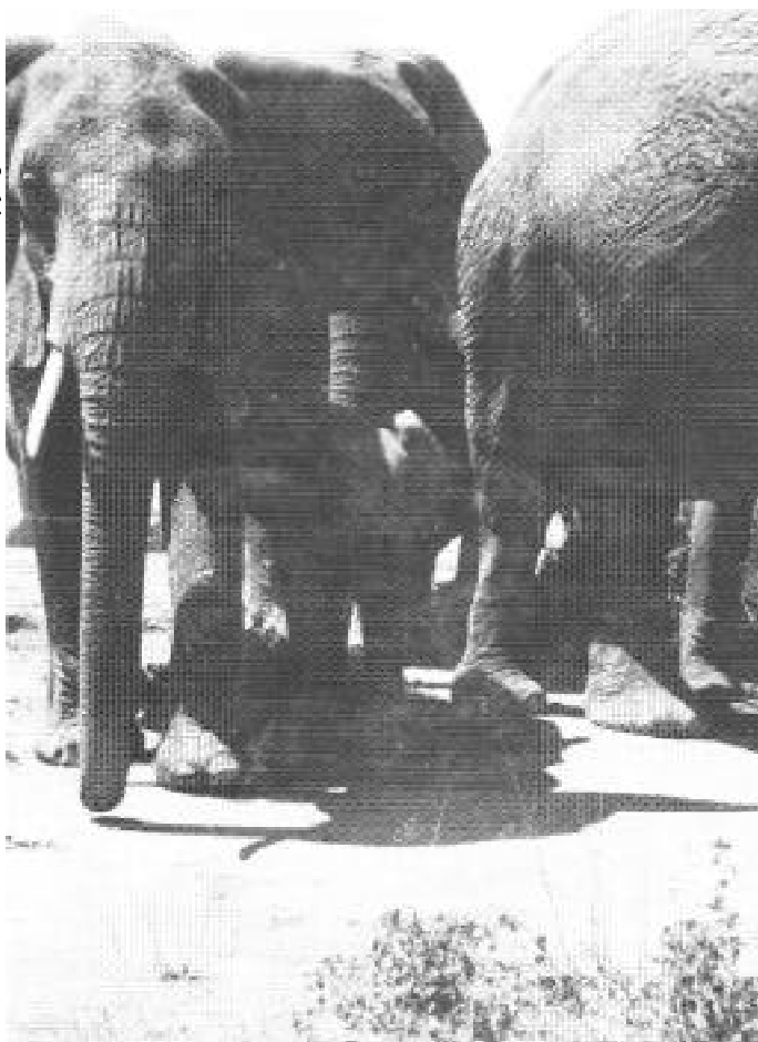
Elephants in Amboseli National Park, Kenya