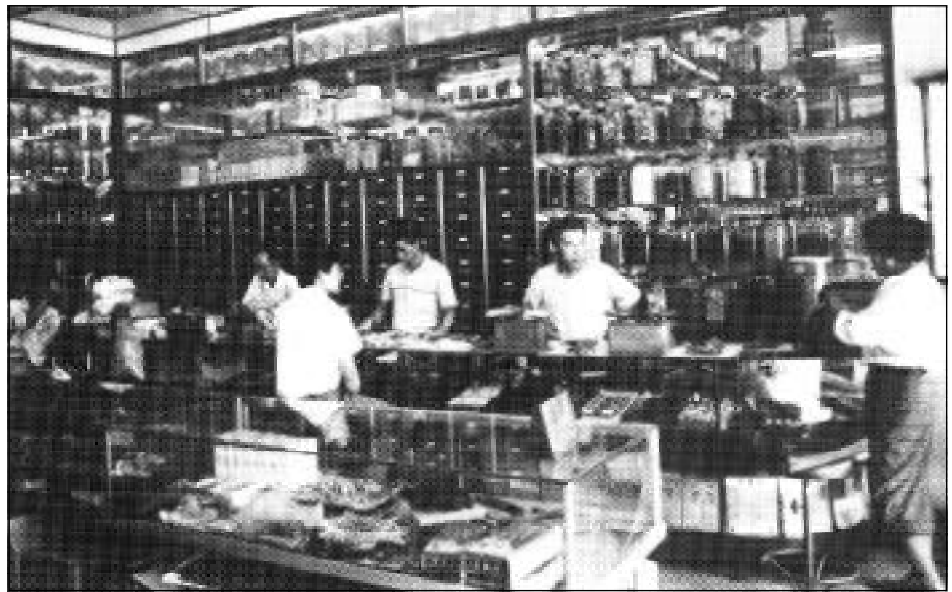
This is a large traditional medicine shop in Bangkok selling an assortment of animal and plant products

Rhino products were displayed so openly that it was hard to believe that at least since 1972, the Thai government had banned international and internal trade in Sumatran rhino products, and being a member of CITES since 1983, the international trade in all rhino species' products since then was supposedly prohibited.