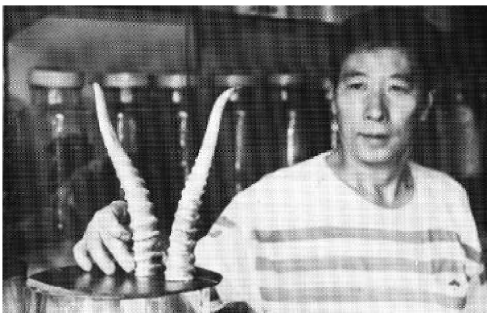
A pharmacist in Bangkok displays two saiga antelope horns. These are for sale in nearly all Bangkok's traditional medicine shops. Shavings from the horn are sold to reduce fever a substitute for rhino horn

The most expensive Sumatran rhino product in the shops is horn priced at an average of US$ 16,300 a kilo. Sumatran rhino nails are known as poor man's horn as they, too, are prescribed to treat fever. Nails cost some US$ 2,000 a kilo, about an eighth the price of horn, and several pharmacies offered them for sale. The main trader told us that he had been unable to buy Sumatran