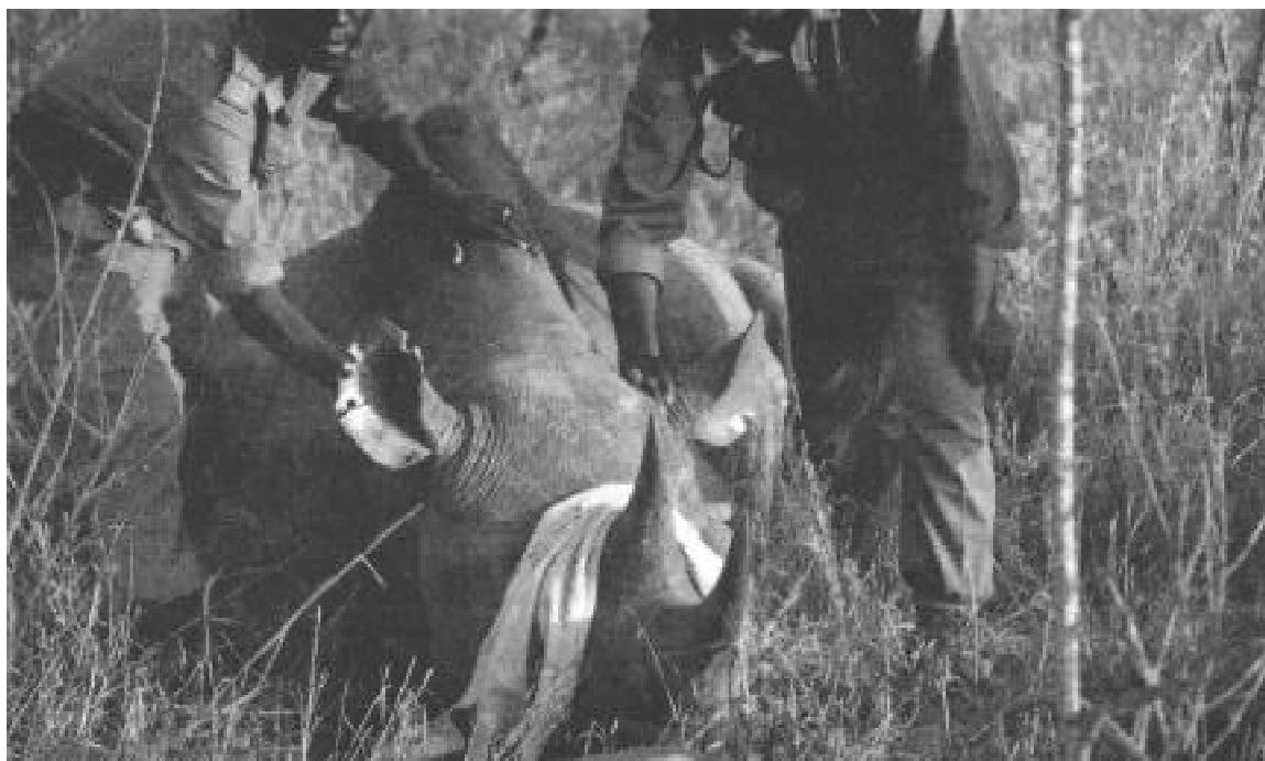
A blind-folded, immobilised black rhino in HUP.