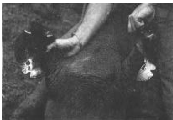
Ear-notched black rhinos in HUP