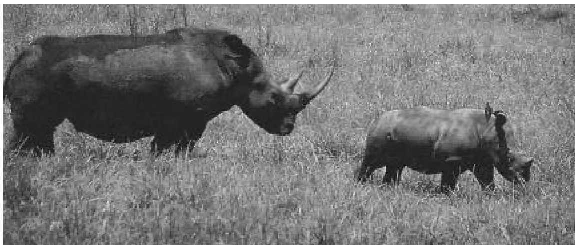
A female northern white rhinoceros with her calf, Garamba National Park, Zaire.