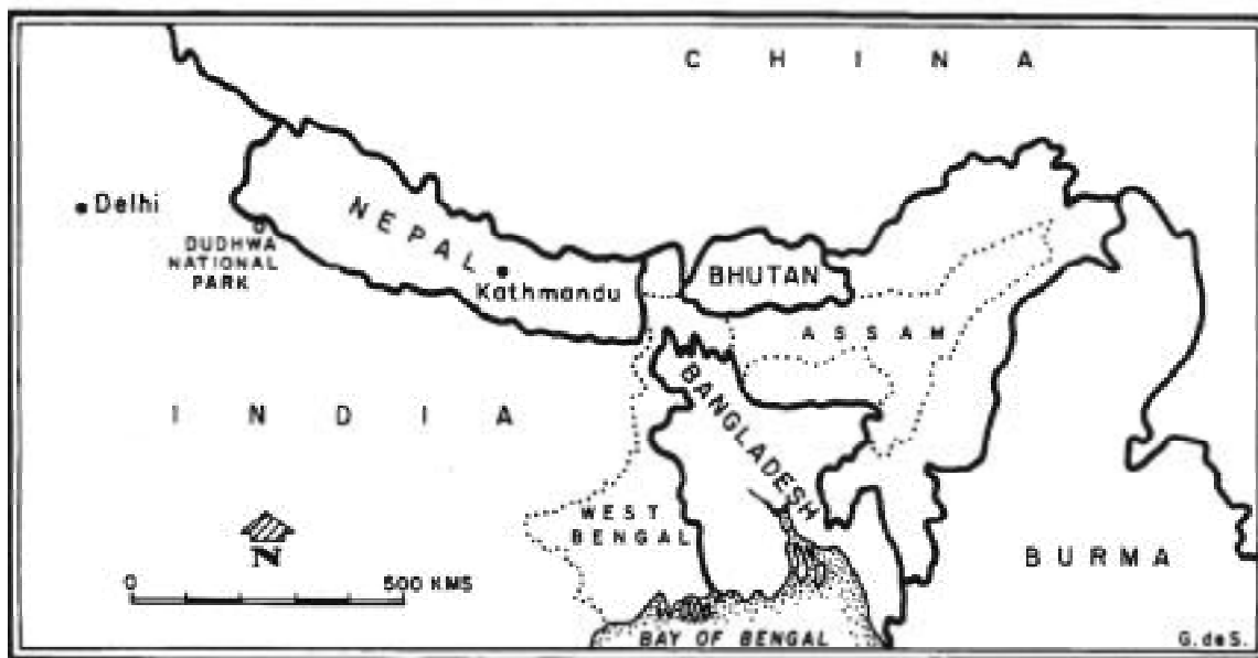
A map showing the main areas referred to in the text.