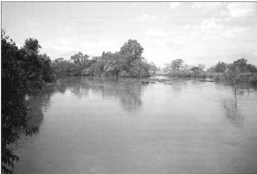
Kaziranga flooded, with almost the entire Park under water during the last phase.