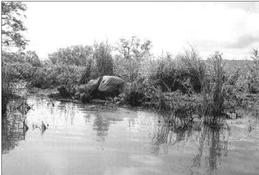
Carcass of a rhino ( Rhinoceros unicornis ) that died due to drowning in Kahora range area.

the artificial high grounds (totaling 69) and roads, while a few moved towards Kukurakata Hill RF, Burhapahar hillock, Panbari RF, Bagser RF, the northern range of Karbi Plateau and the adjacent tea, coffee and rubber gardens. But during peak days of the flood in the third phase, when almost all the artificial high grounds were underwater (as well as the entire Park), the majority of wildlife populations moved out of the Park in a panicked state. During this time, the wildlife had to cross the busy NH 37 as well as pass through human settlements. This resulted in large-scale loss of wildlife which were either hit by vehicles or killed by the villagers and plantation labourers. In northern areas of the Park, some animals tried to cross the