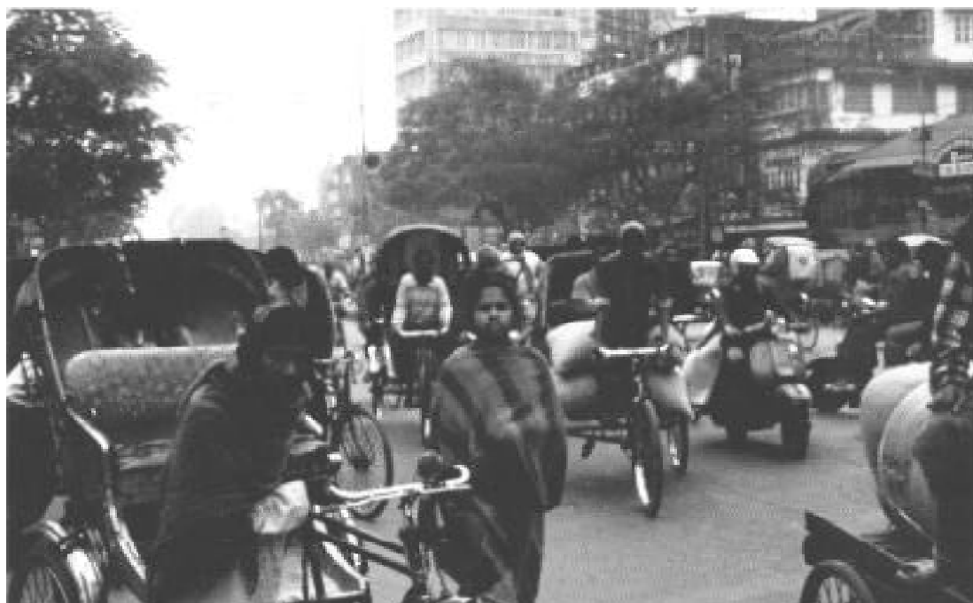
Photo 2. Siliguri in the northern part of West Bengal, is the center for the illegal wildlife trade in the region. The town is booming economically, but it is ugly and noisy.

market, a huge retail market in the centre of the town where prices can be 40% less than in other Indian bazaars.