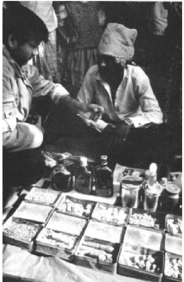
Photo 4. Itinerant traders move around West Bengal selling traditional medicines. This Hindu, originally from Uttar Pradesh, was offering at the end of 1993 a tiger 'navel' for $3 to relieve epileptic fits, tiger fat for $3 per 20 grams to cure piles, and other wildlife products.

It is with rhino horn that Siliguri traders make most money, and there is thus a network of middlemen moving them from Assam to Siliguri and then mostly to Bhutan. This network has been active since about 1985, when Calcutta traders became uneasy about handling rhino horn due to increased vigilance by the authorities (Martin, 1996). From 1983 to 1997 18 rhino horns were seized in 22 cases in and around Siliguri compared to only one seized in Calcutta during this 15-year period (in 1995). In June 1995 three senior members of the biggest syndicate trading in rhino horn were arrested by the Siliguri police after a large quantity of horns were offered for sale. It was the first arrest of its kind in India (Breedon and Wright, 1996; Anonymous, 1995b). The group consisted of a Taiwanese, a person of Chinese origin and a Tibetan. The police also seized two rhino horns weighing a total of 680g in a Siliguri hotel. Under interrogation, the men gave a