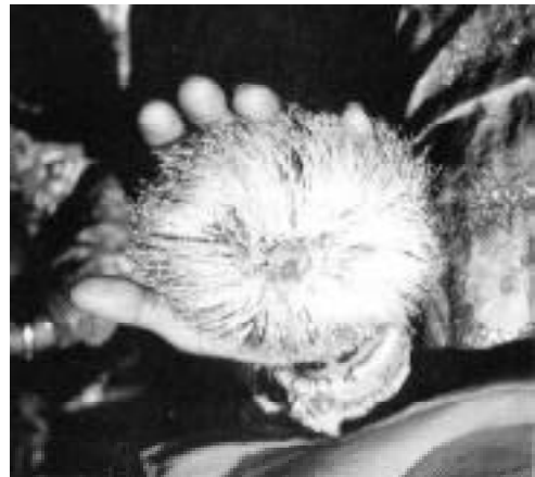
Photo 5. In the village of Gairkhata between Jaldapara Wildlife Sanctuary and Siliguri, low quality musk from this musk deer pod was on sale for $25 per ten grams in December 1993.