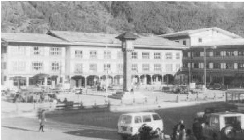
Photo 3. Some of the major rhino horn traders in Bhutan have lived in Thimpu, the capital.

mous, 1995b, Anonymous, 1995c). In September 1995 four tiger claws were seized in Siliguri (Belinda Wright, pers. comm., 1999). In early 1996 20 leopard skins and a tiger skin were confiscated at New Jalpaiguri's railway station, just eight kilometres south of Siliguri; skins probably came from Assam and were to be sent to Calcutta businessmen (Anonymous, 1996). There is even a thriving trade in live leopard cubs from the Siliguri area to Nepal and Thailand via Burma (Wright, pers. comm., 1999).