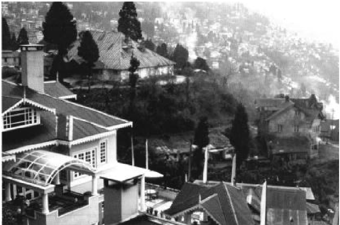
Photo 1. The hill town of Darjeeling is famous as a resort and tourist centre, but is also known for its illegal wildlife traders